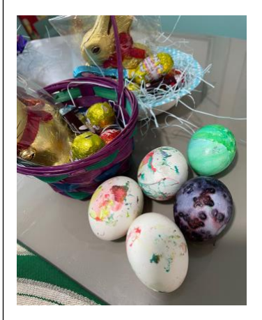
.Easter chocolate and decorated eggs.